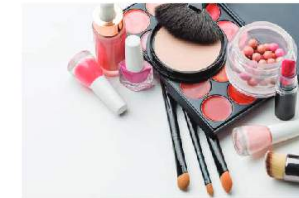
Cosmetics and Toiletries Testing