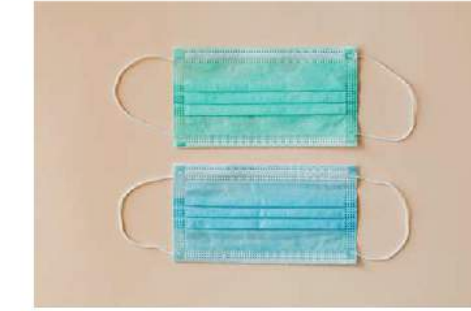
Face Mask Testing