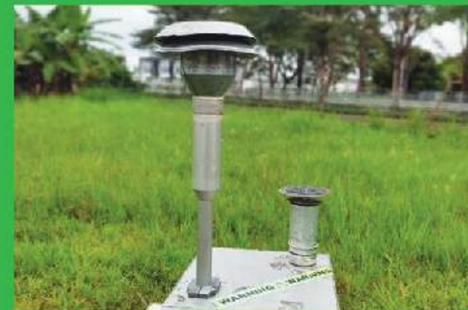
Environmental Impact Assessment