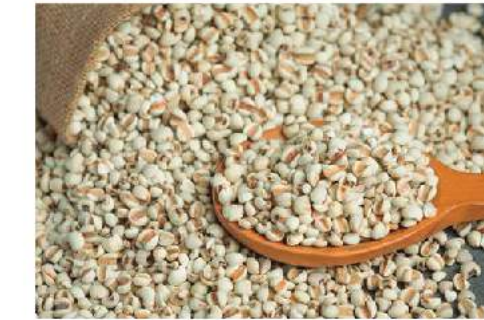
Animal Feed Testing