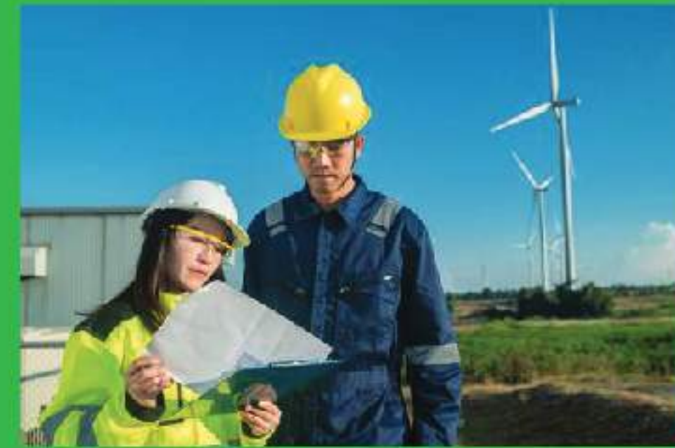
Environment Pollutant Monitoring and Carbon Footprint Profiling