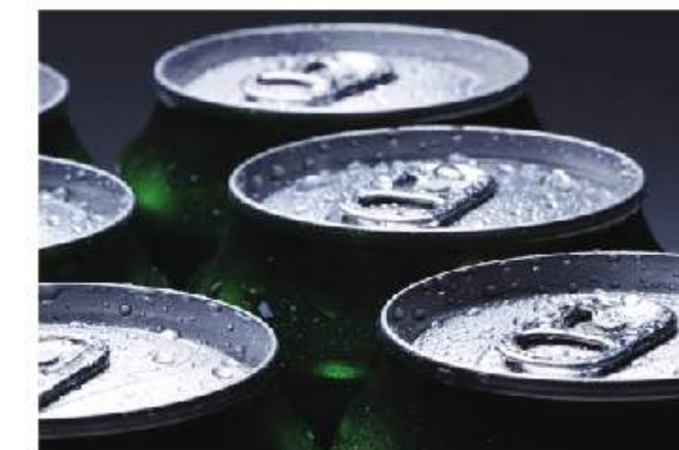
Food Additives and Mineral Contaminants Testing