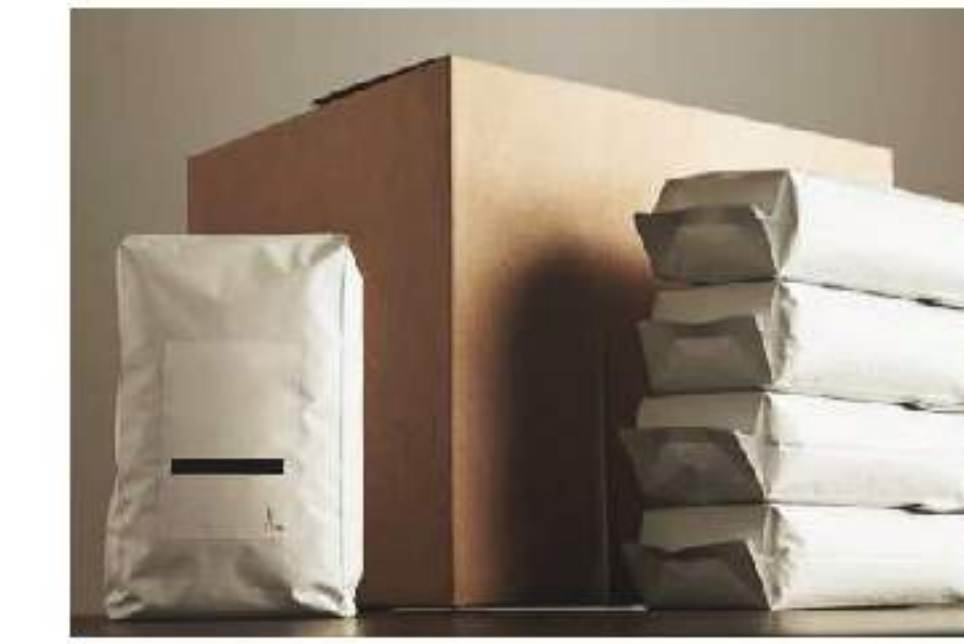
Food Packaging Materials Testing