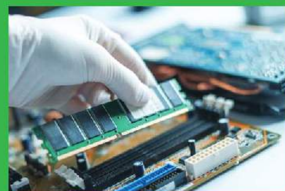
REACH and RoHS Analysis