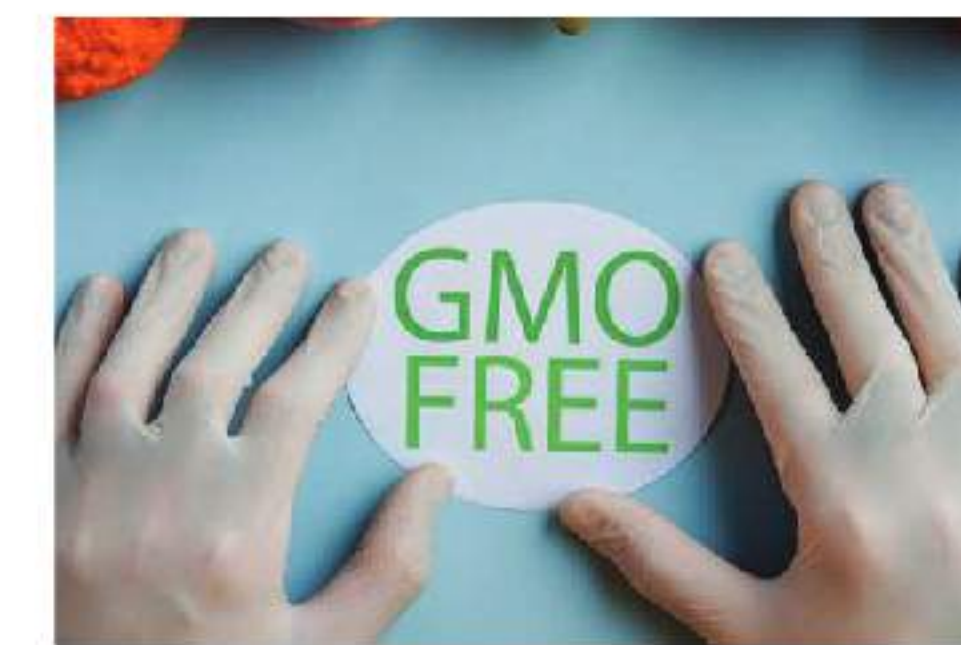
Halal, GMO, and Bacterial and Virus Testing