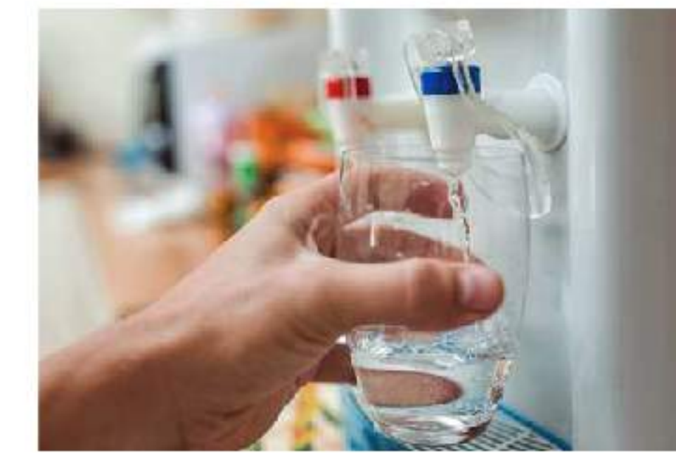
Drinking and Ultrapure Water Testing