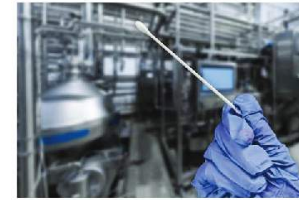
Surface Swabbing / Air Testing