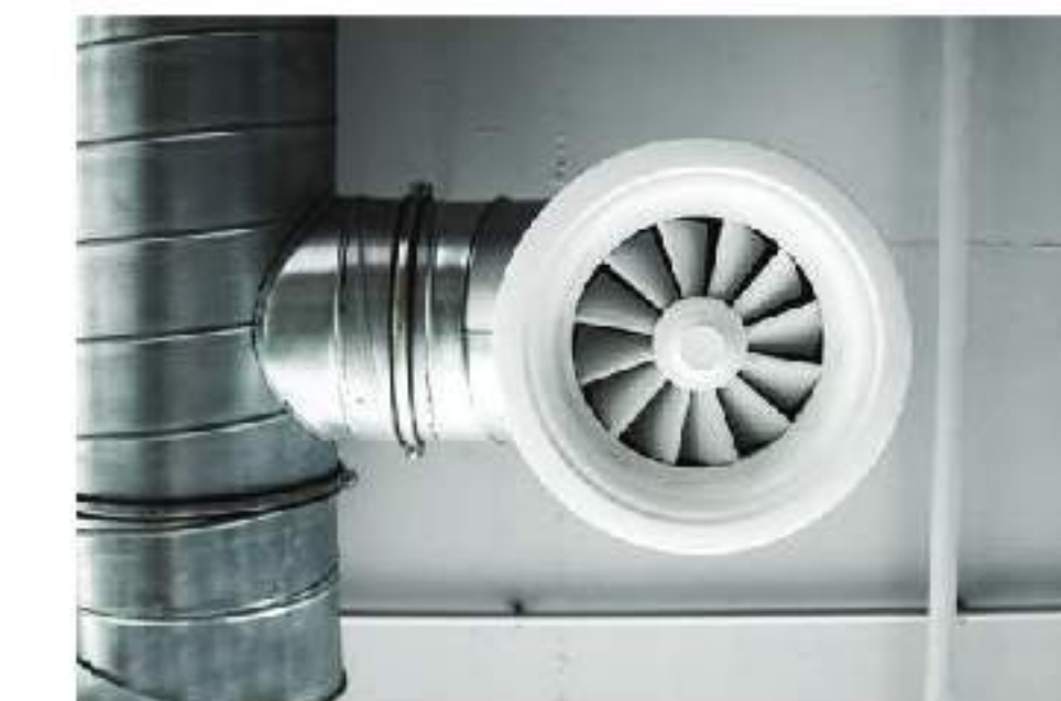
LEV (Local Exhaust Ventilation) Assessment