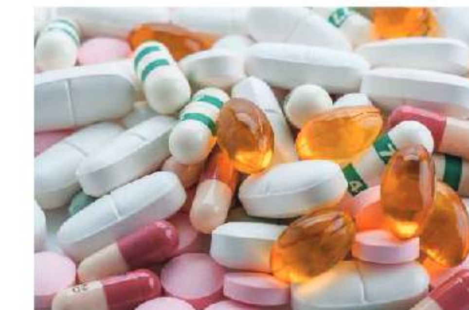
Pharmaceutical Drugs and Traditional Herbs Testing