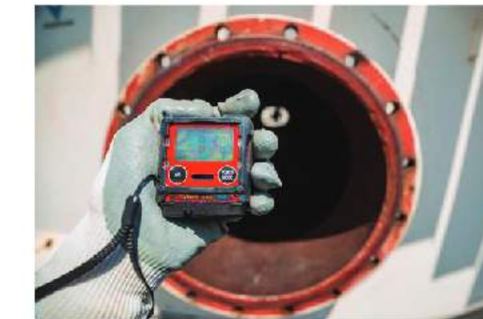
Chemical Exposure Monitoring