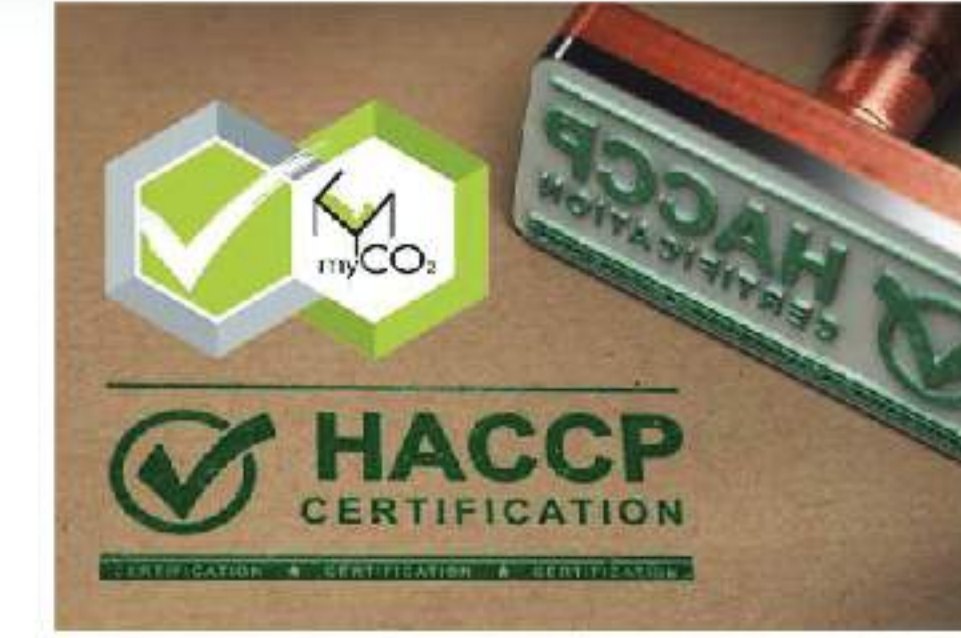
ISO 22000 Food Safety Management System Certification and Hazard Analysis and Critical Control Point (HACCP)