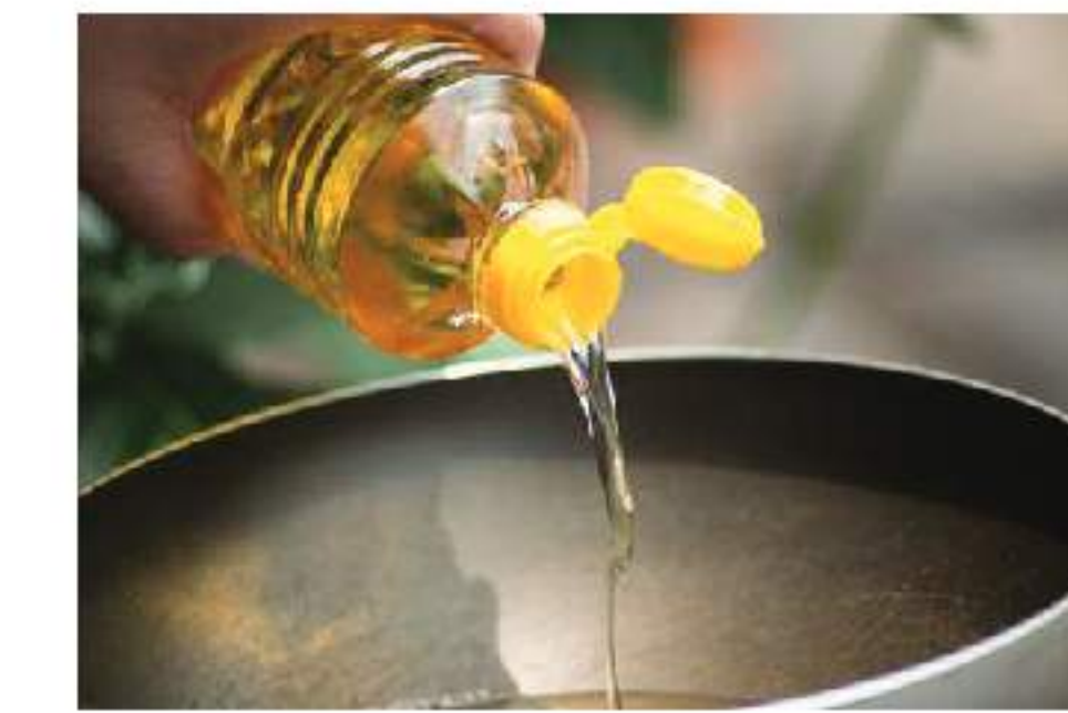
Edible Oil Testing