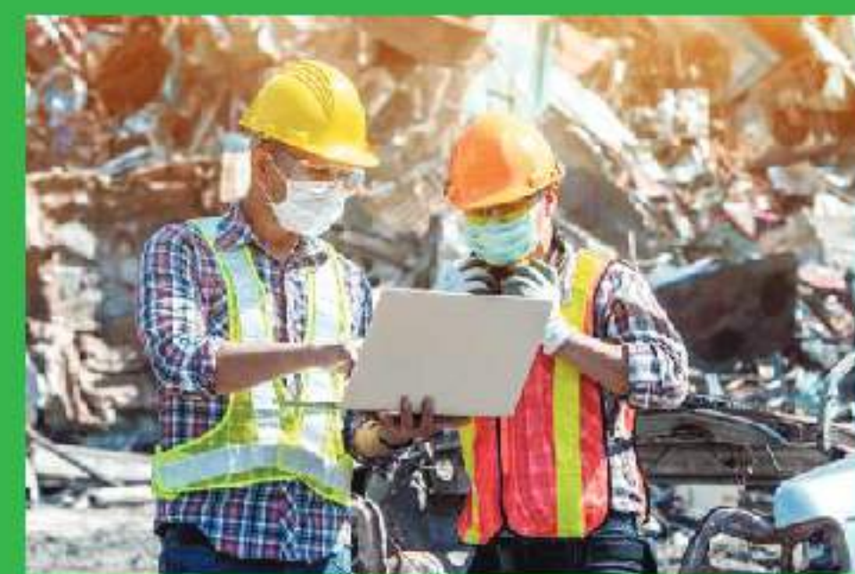
Schedule Waste Analysis