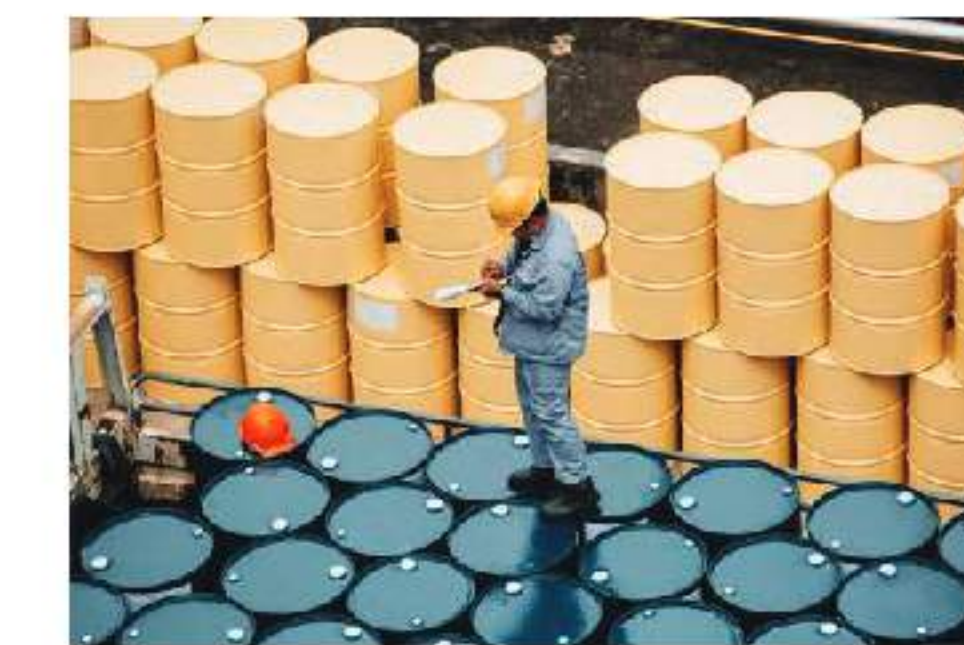
CHRA (Chemical Health Risk Assessment) | HIRARC (Hazard Identification, Risk Assessment, Risk Control) | Chemical Classification