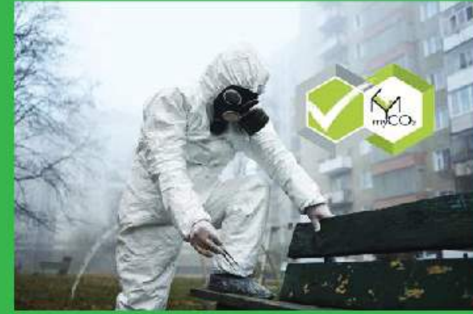
ISO 14001 Environmental Management System