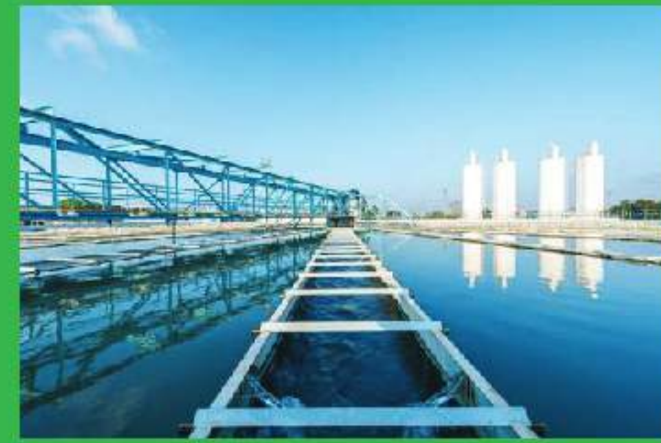
Wastewater and Sewage Study