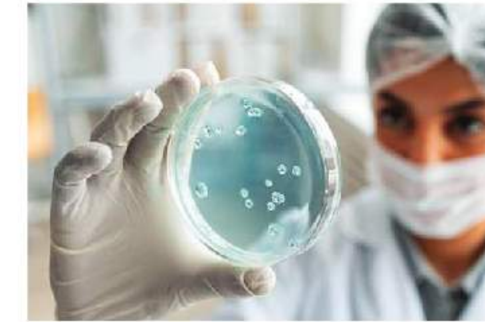
Microbiology and Their Toxins