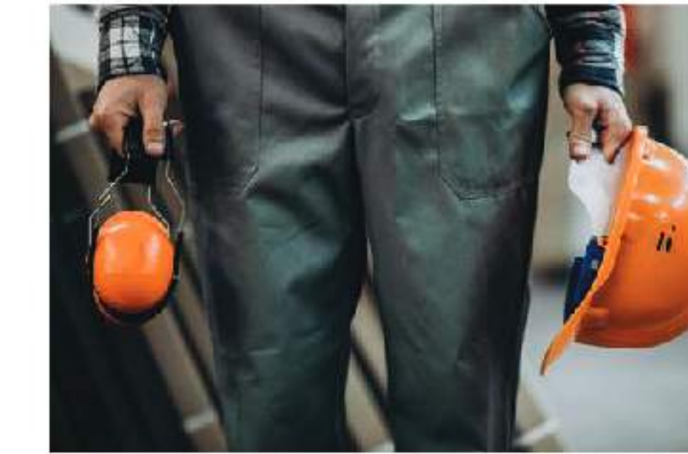
Noise Risk Assessment