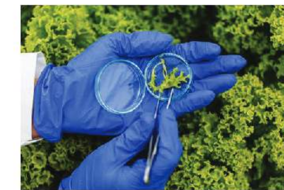
Food Contaminants Analysis